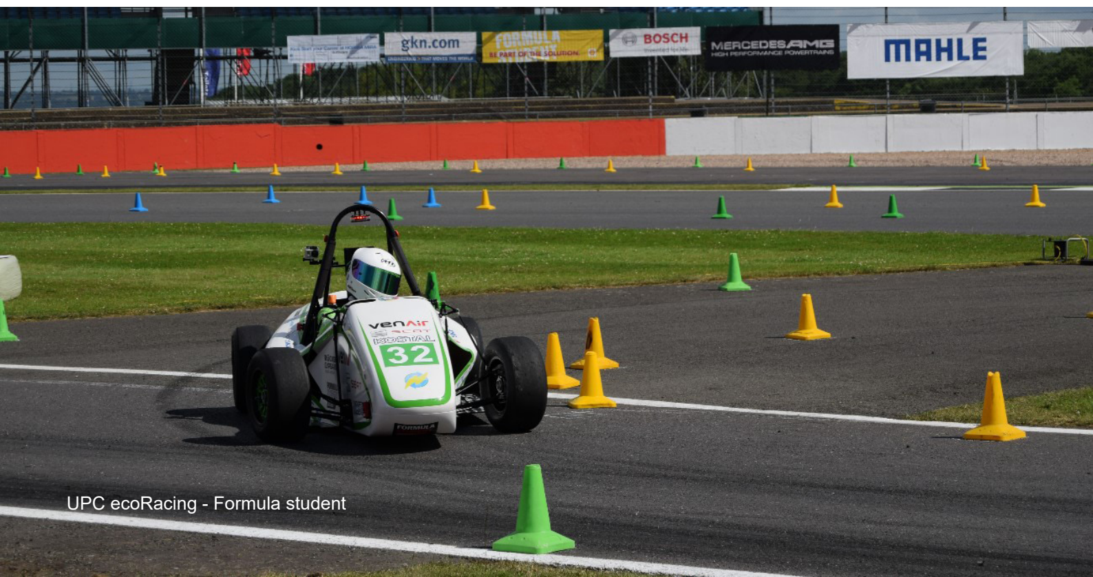
UPC ecoRacing - Formula student

Exchange students have also the possibility to come to our institution to undertake their Undergraduate Dissertation/Master's Thesis and or PhD thesis.