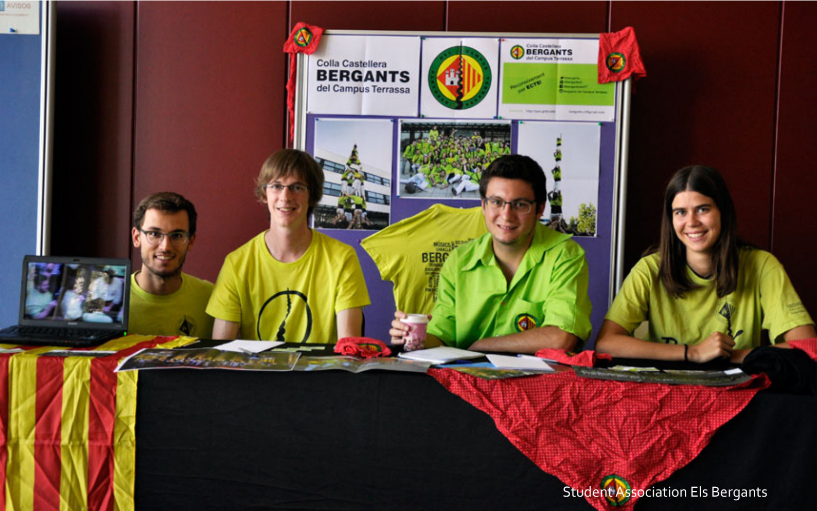
Student Association Els Bergants