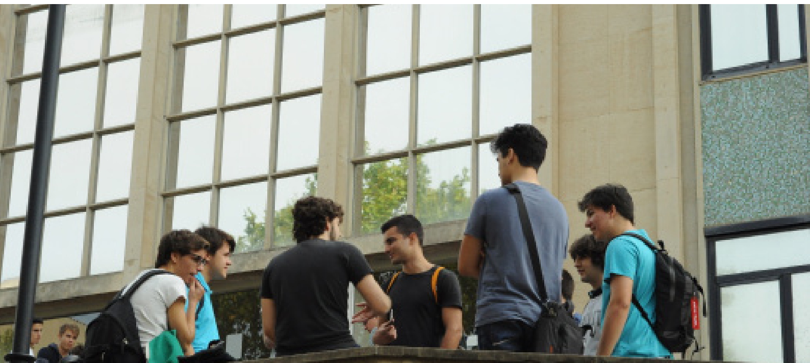
Students at the entrance of TR5 building