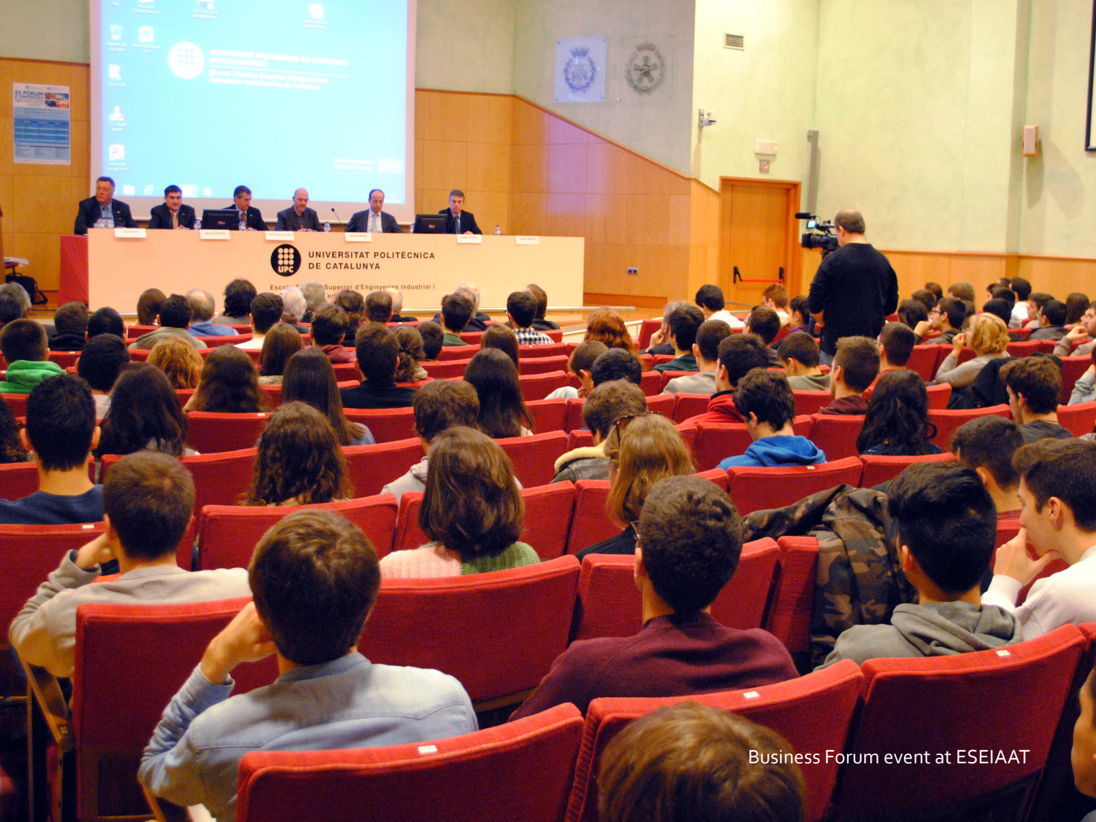
Business Forum event at ESEIAAT