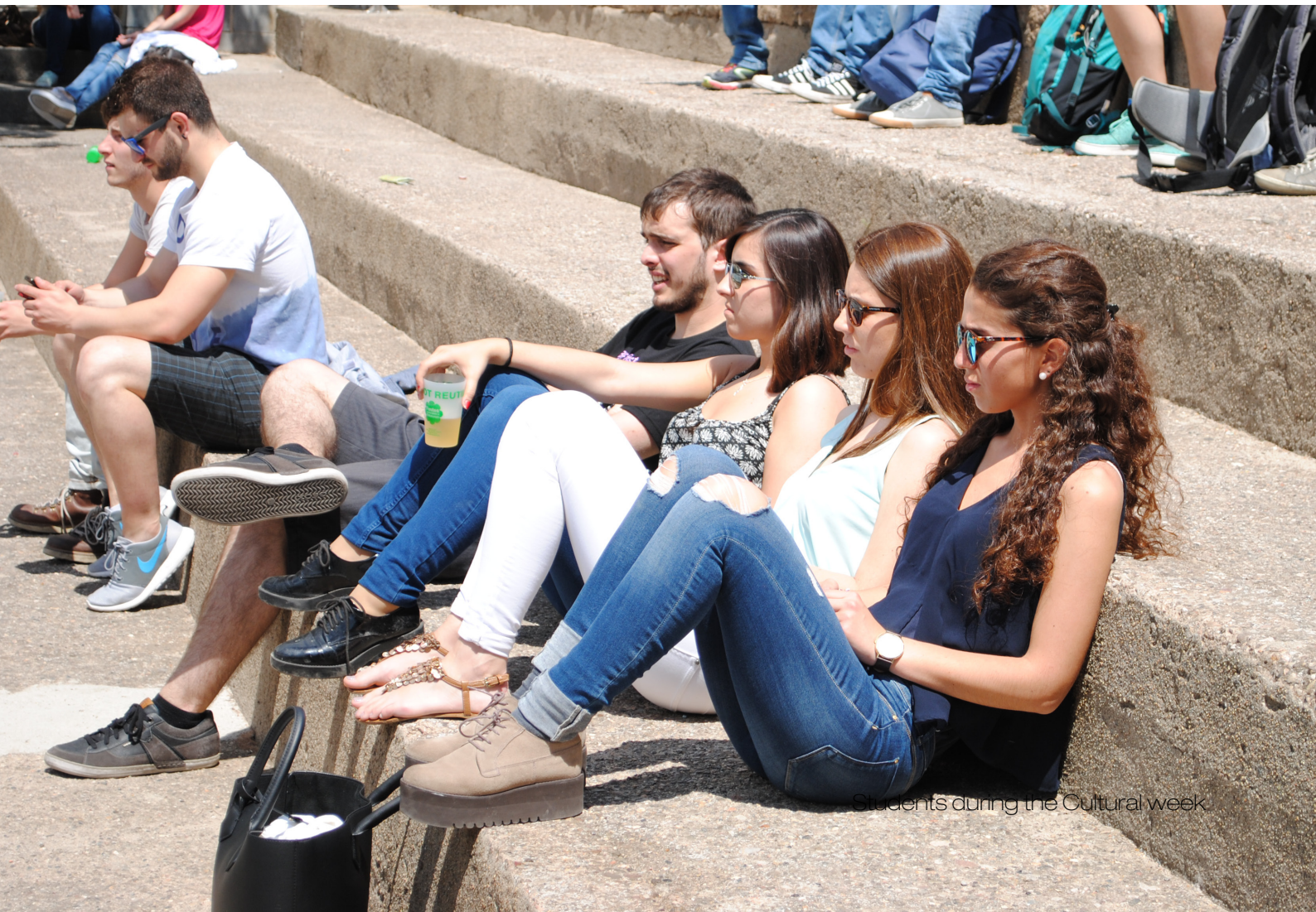
Students during the Cultural week

One good option for international transfers with small fee charges is a service called Transferwise . Please make sure you check their fees and conditions on their Website.