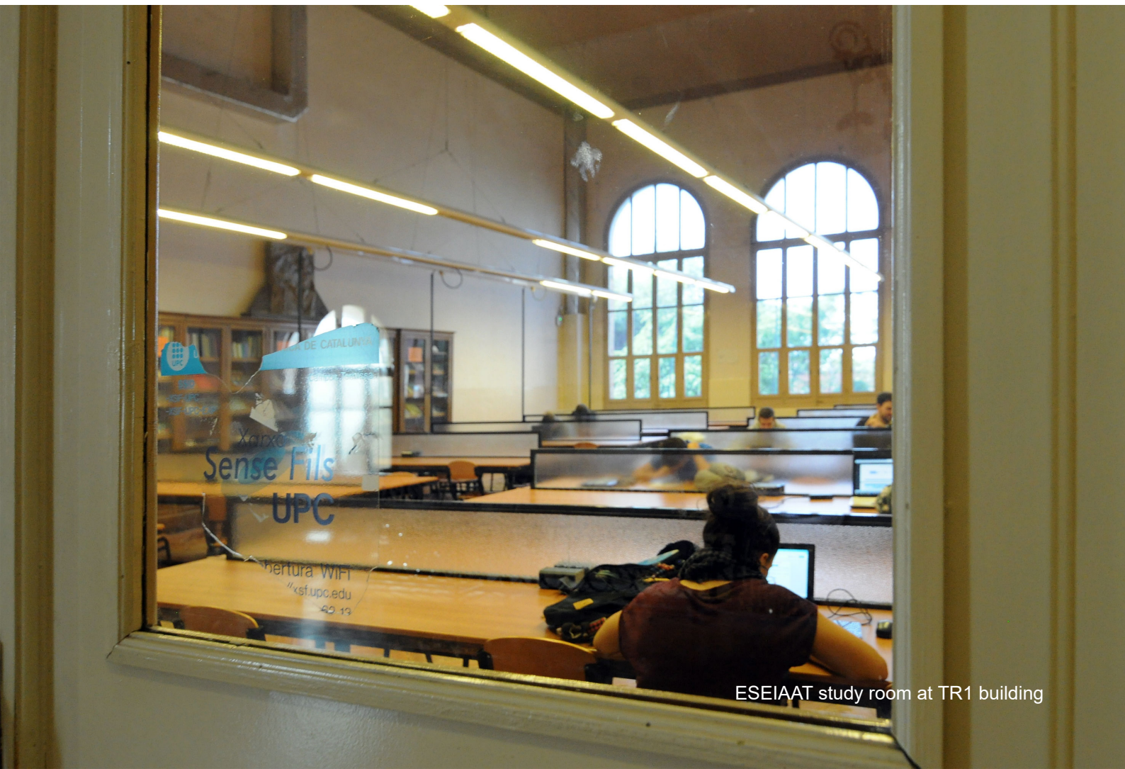
ESEIAAT study room at TR1 building

Colom Street number 2. 08222 Terrassa. Telephone number is: +34937398700.