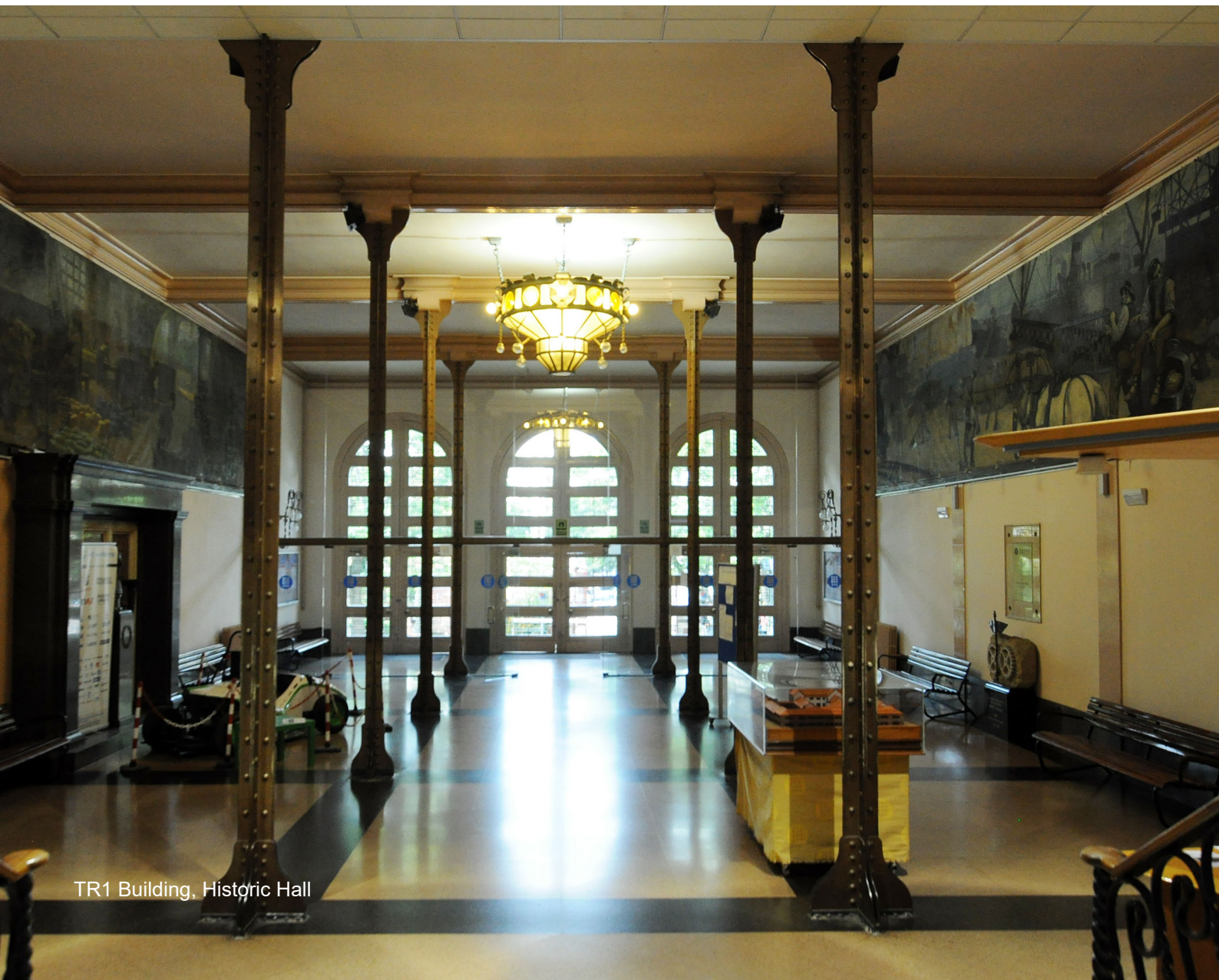
TR1 Building, Historic Hall

Mobile phone tariffs may vary from 15 to 50 euros per month depending on data usage, phone call minutes contracted, etc.