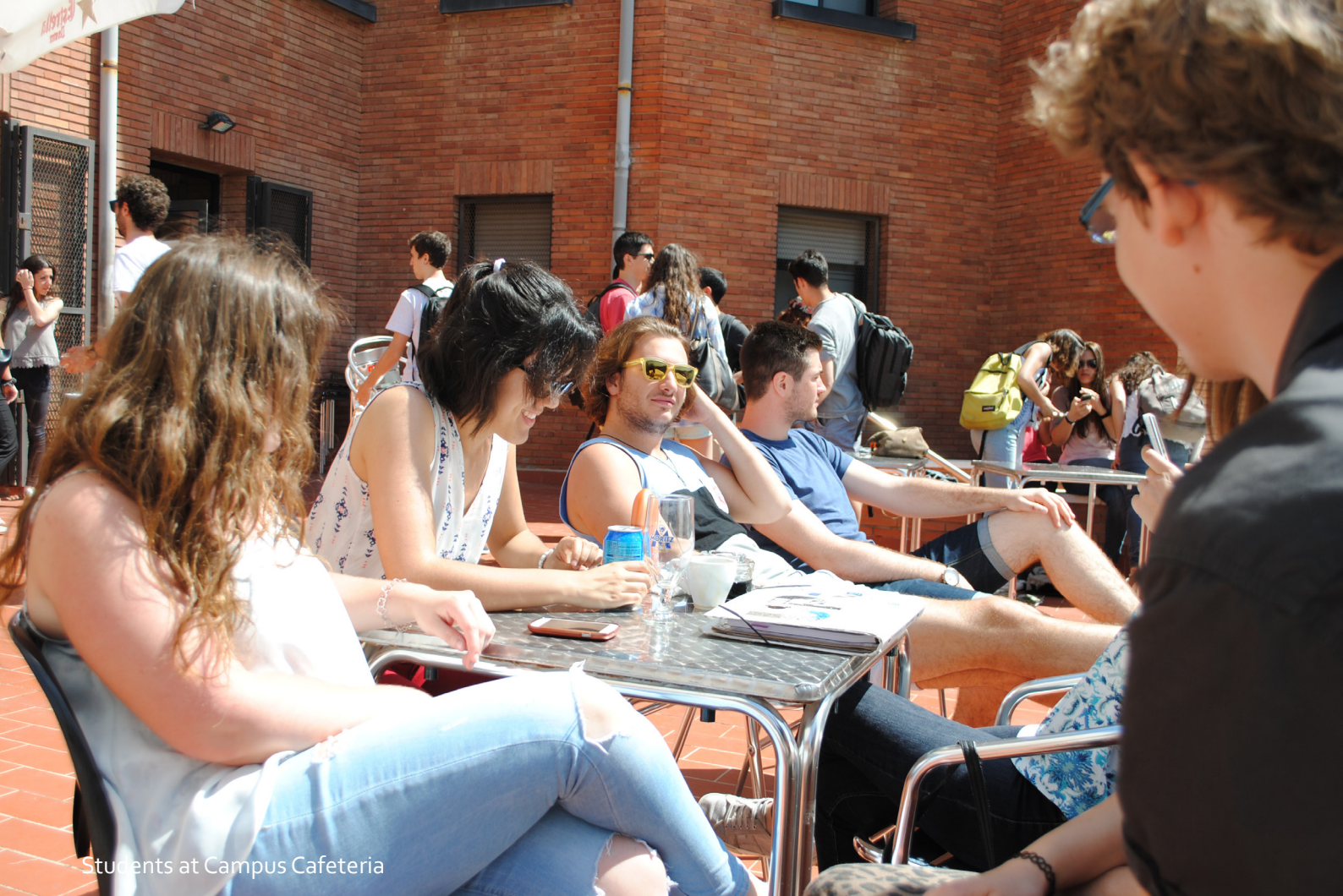
Students at Campus Cafeteria

There is also the possibility of preparing for official Spanish language examinations such as the DELE, which is awarded by the Spanish Ministry of Education.