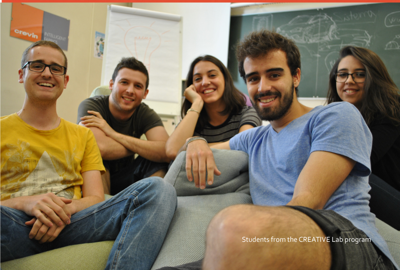
Students from the CREATIVE Lab program