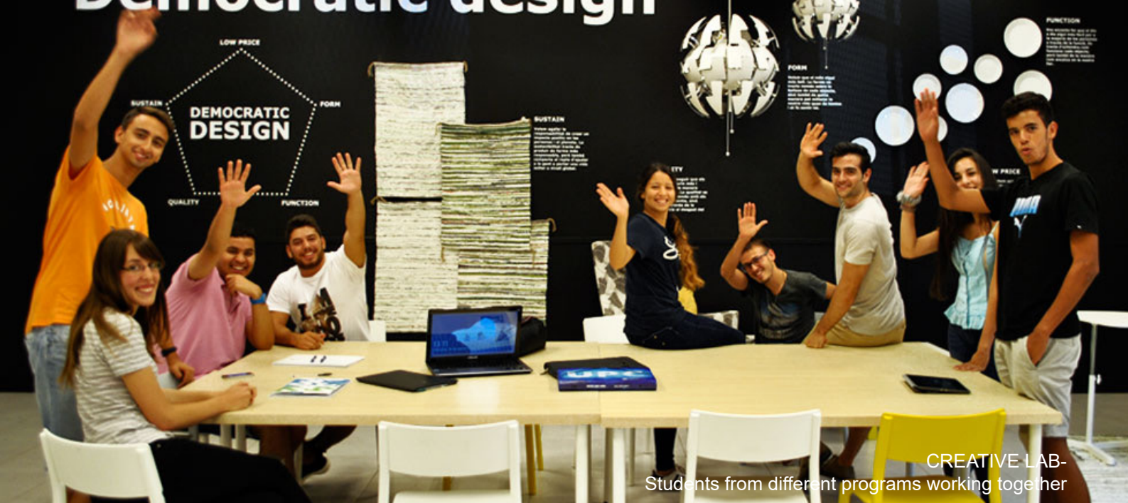
CREATIVE LAB- Students from different programs working together