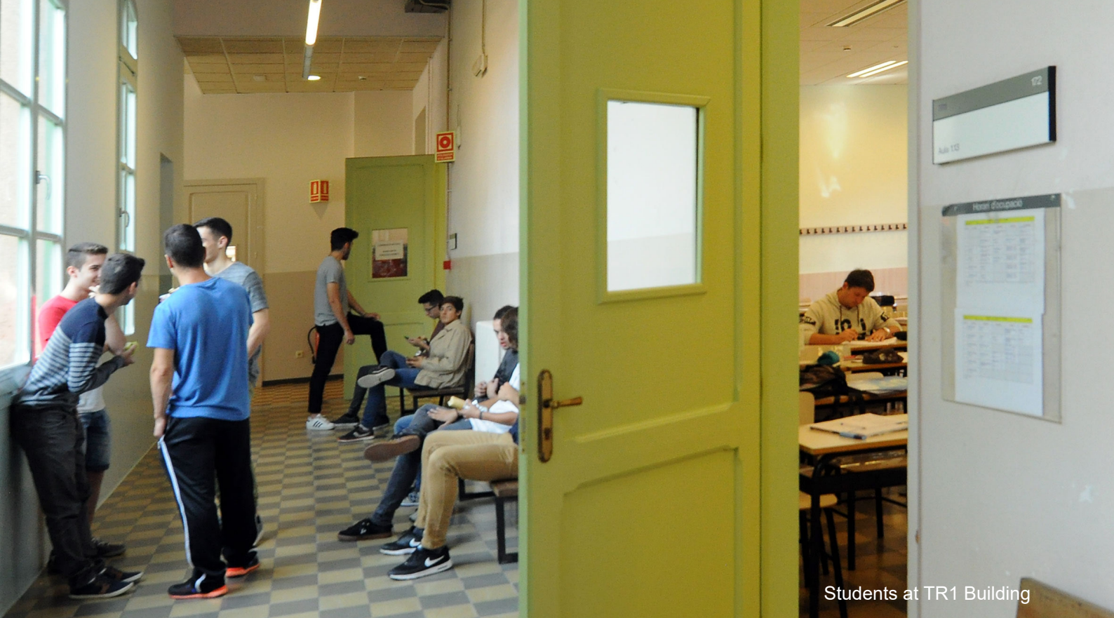
Students at TR1 Building