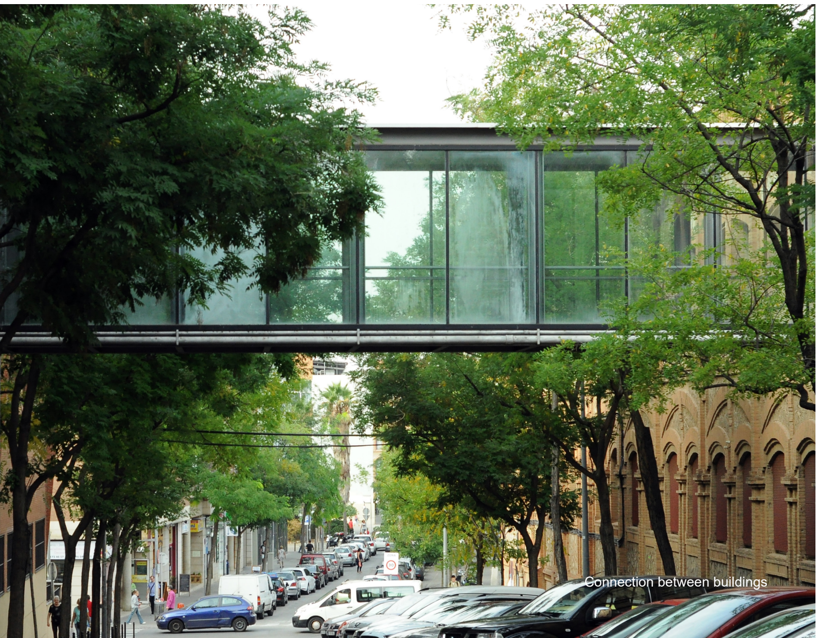
Connection between buildings

In order to apply for the Foreigners Identification Card or TIE, it is compulsory to arrange an appointment at a Police Station. You can do that in any police station in the Barcelona province. You can go to any Police station that appears in the list for appointments. You have instructions on how to make an appointment on the following link .