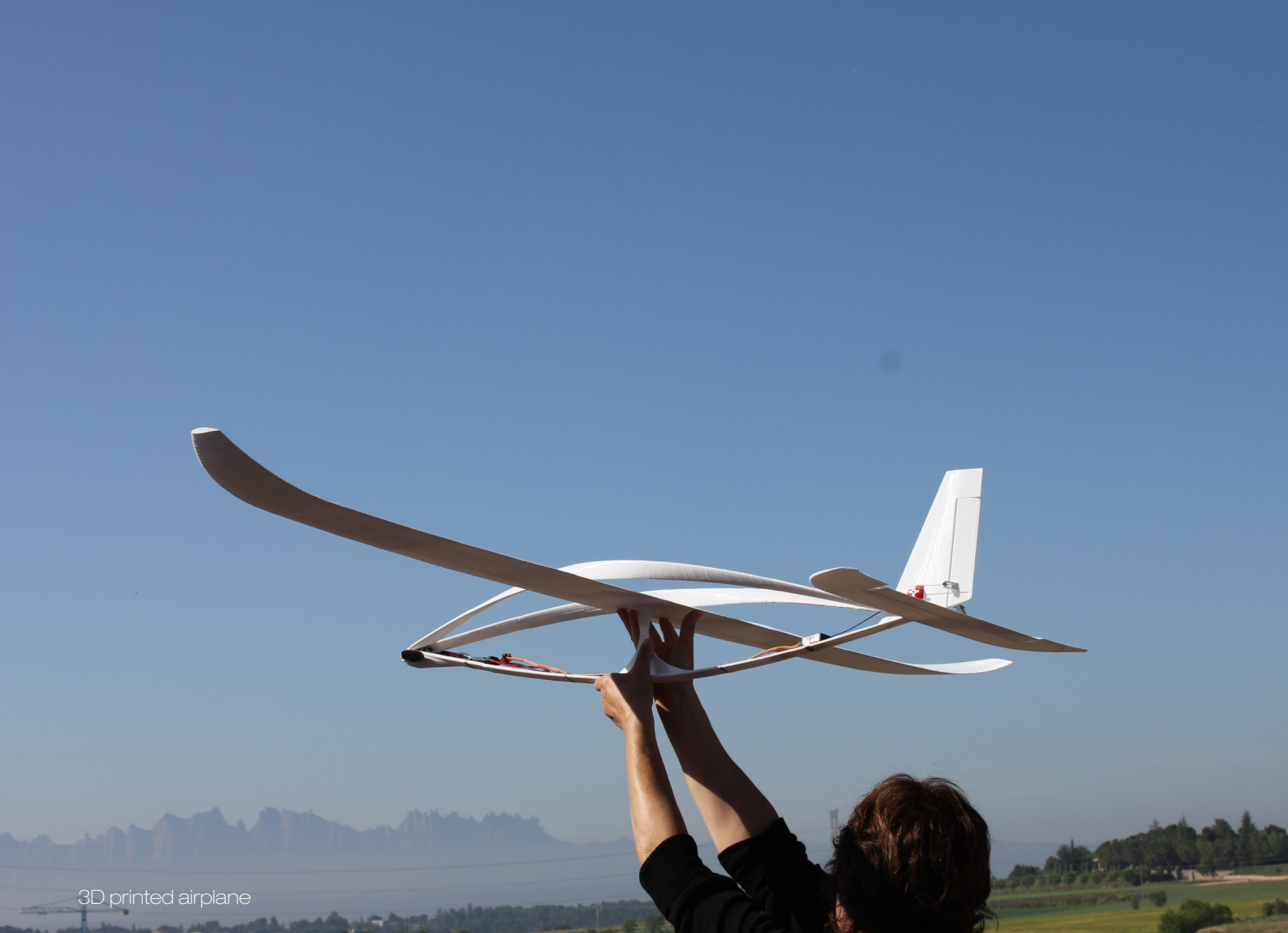
3D printed airplane