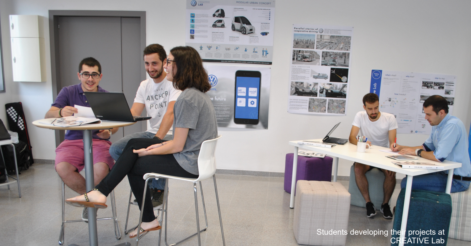
Students developing their projects at CREATIVE Lab