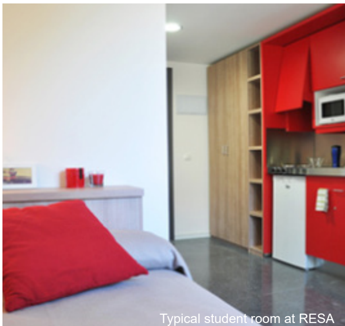
Typical student room at RESA