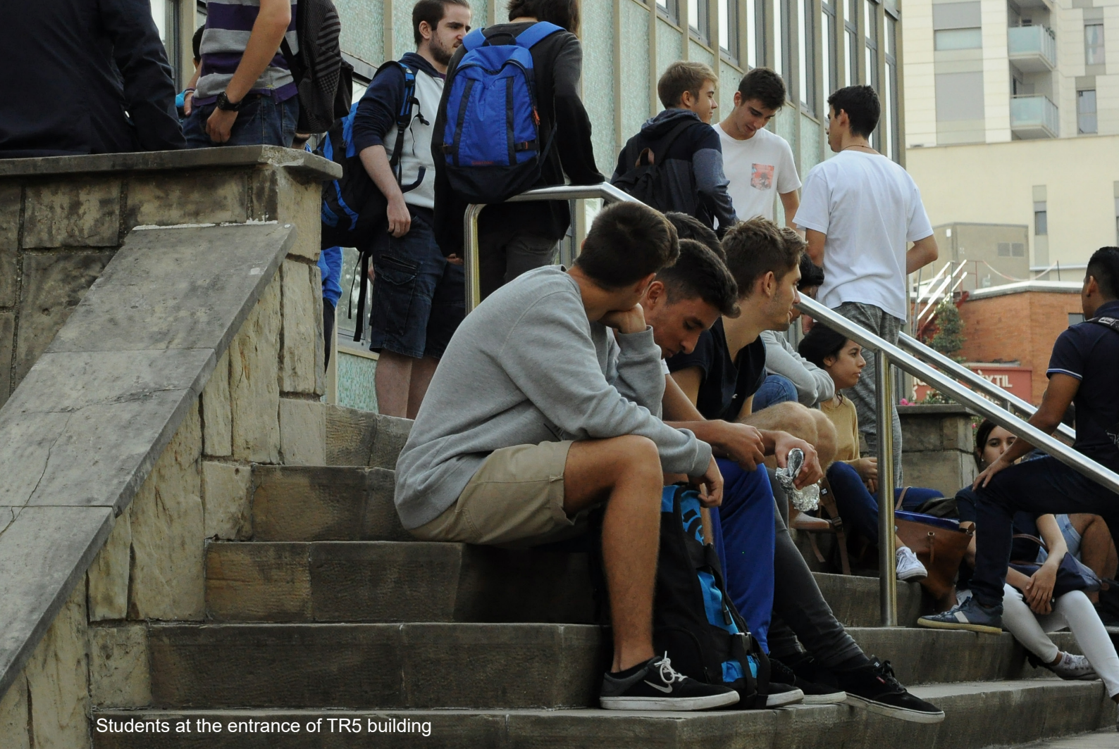
Students at the entrance of TR5 building